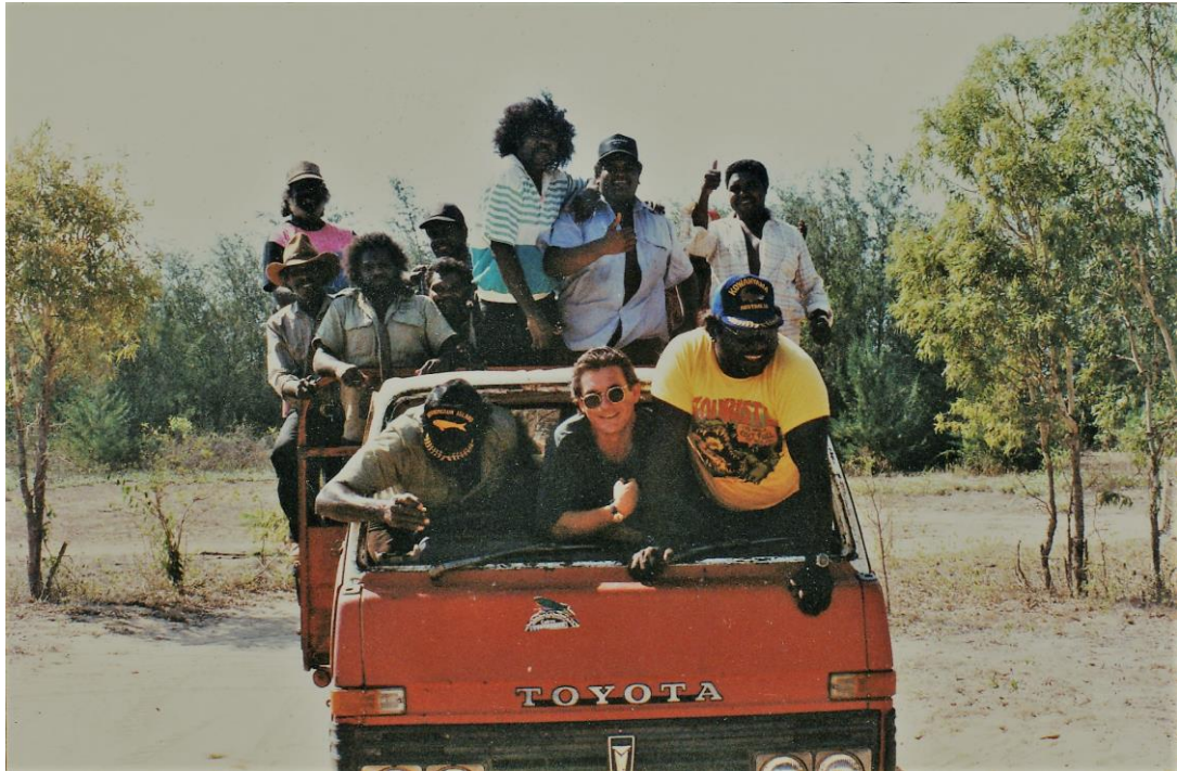
Mornington Island 1992