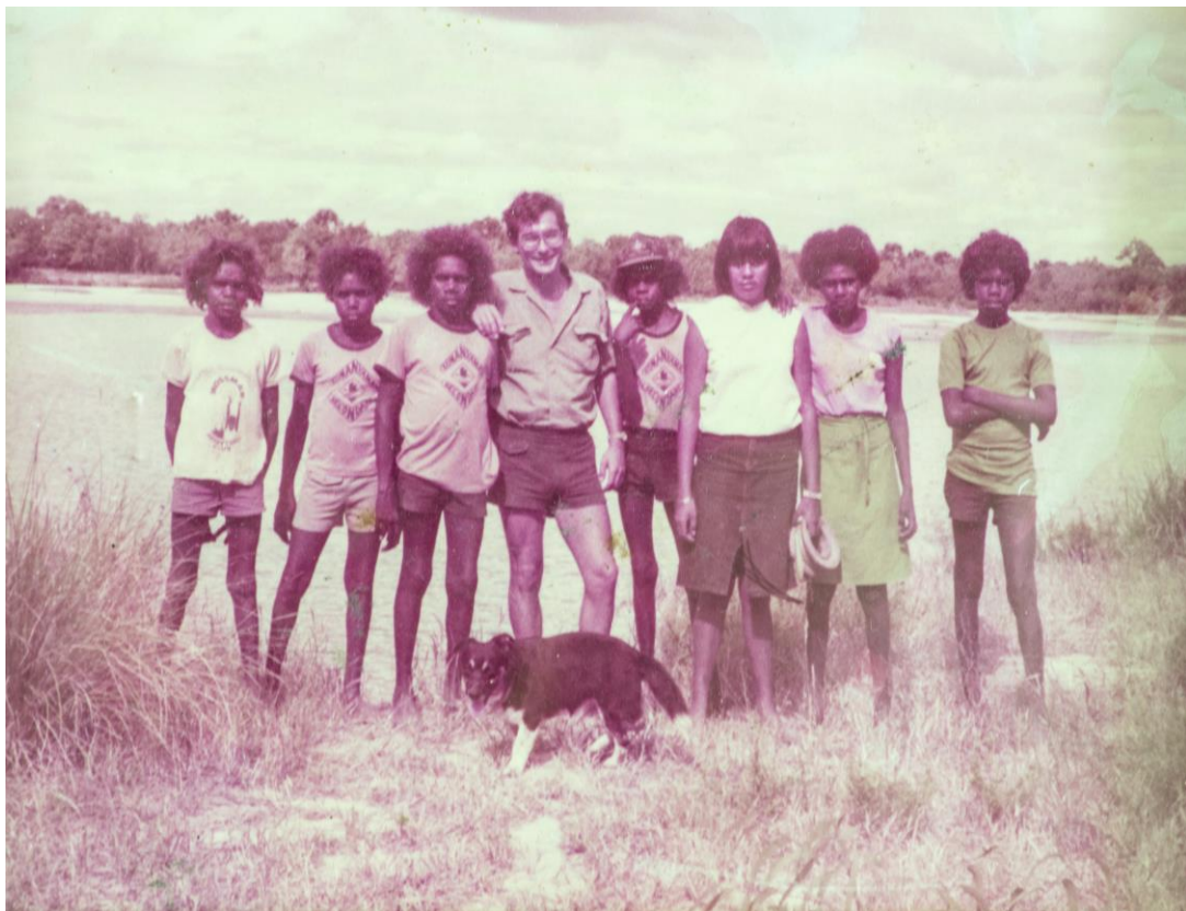
Mitchell River Kowanyama 1985